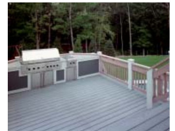
The outdoor kitchen and dining area

The availability of products that allow for full-service outdoor kitchens has blossomed recently. The outdoor kitchen you see to the left is completely outfitted with Viking appliances