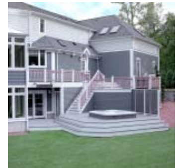
The three-level deck

Designs that include multiple levels help to create a sensation of “rooms” with different purposes, and these levels can be separated by as little as a few steps or as much as a full story to provide access from different points in your home. The deck at right was added onto the back of this new-construction home. The upper level connects directly to the kitchen, making it easy to use the outdoor and indoor spaces together when entertaining. The upper-level deck also gives access through a separate door to the living room. The stairs descend a few steps to the outdoor dining area, which has room for patio furniture and is equipped with a built-in commercial grade grill. The stairs continue down to the spa area, which is conveniently adjacent to the basement level home gym, so the homeowner can go right from work out to hot tub. This area is also adjacent to the basement bar/game room (pictured on page 1), creating a circular flow between the first-floor interior spaces, exterior deck dining and spa area, and the basement bar area. This design is ideal for summer parties, fitness, and relaxation.