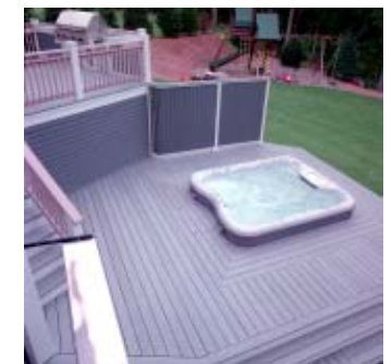
View from above of the spa area